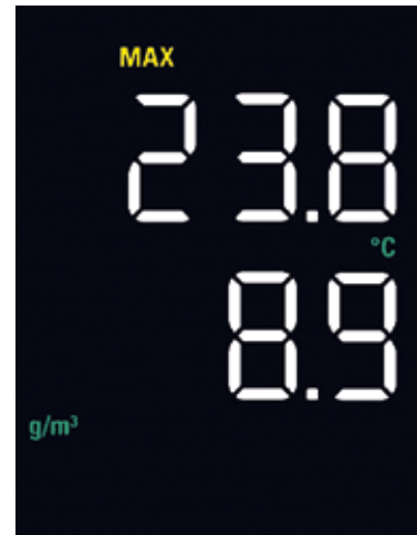
Customized measurement display